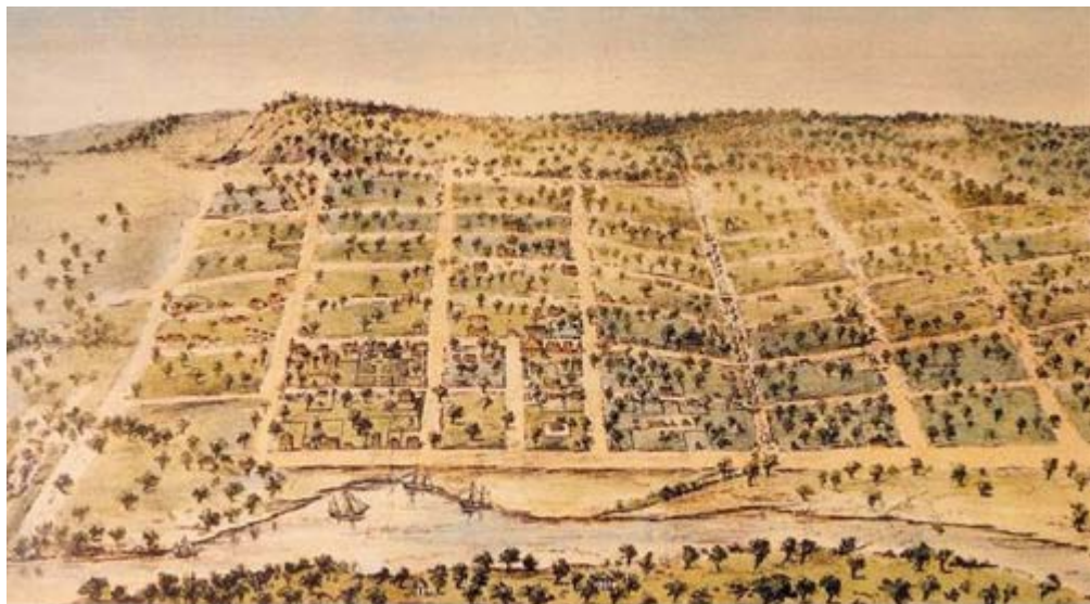
Clarence Woodhouse, Melbourne in 1838 from the Yarra River, c. 1888.

On 1 November 1837, Batman purchased several blocks of land from the Crown, including a slightly swampy half-acre on the corner of Swanston and Flinders Streets to the east of the main settlement, part of Allotment 8 in Section 3 of the Town of Melbourne. 17 He built a seven-roomed cottage named